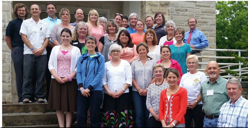
A Fiesta of FUNdraising was held May 5 in Bethany Lutheran Church's Fellowship Hall. Above are representatives from 12 of the 13 participating local nonprofits: Bethany Preschool, Boys and Girls Club, Fredericksburg Dog Park Assoc., Fredericksburg SHINES, the Good Samaritan Center, Habitat for Humanity, Hill Country Community Needs Council, Hill Country SPCA, MOM Center, Stonewall Head Start, Texas Center for Wine & Culinary Arts, and the Texas Society for Preservation of St. Joseph's Halle.

I hope that seeing the number of patients we serve, not only each year, but each month or two, excites and encourages you. You are our partners, and we are all in this together. We couldn't do what we do without you and the entire community.